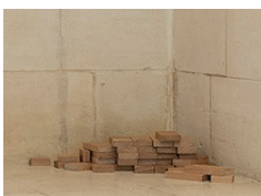
Laundry Mediation Photowork digital print on rag paper, mounted on aluminium 80 x 80 cm