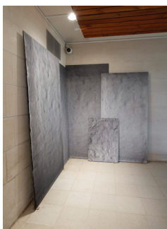
Kitchen Corner Object digital prints on rag paper, mounted on aluminium 5 parts; installation variable