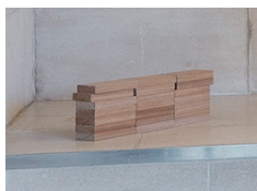
Laundry Models hardwood various sizes