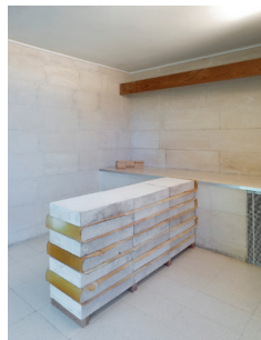
Laundry Object cleaned Mount Gambier limestone blocks, latex installed size 77 x 200 x 30 cm