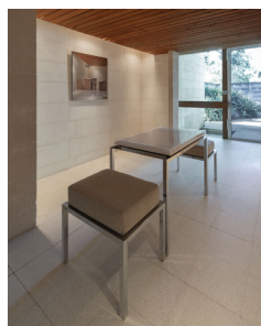
Dialogue Pressing Object chromed steel, upholstery, timber, limestone, pressed plasticine, acrylic (4 pressing events of variable duration with two people) installation variable