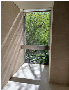
Lower Window Object stainless steel, wax 19 x 137 x 3.5 cm